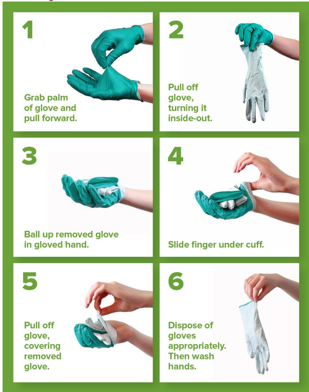
Figure 5 Removing disposable gloves

Dispose of the gloves by placing them inside out in the biohazard bin or in a sealed plastic bag until placed in a biohazard container.