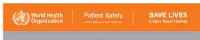
Figure 3 How to hand rub (World Health Organisation)