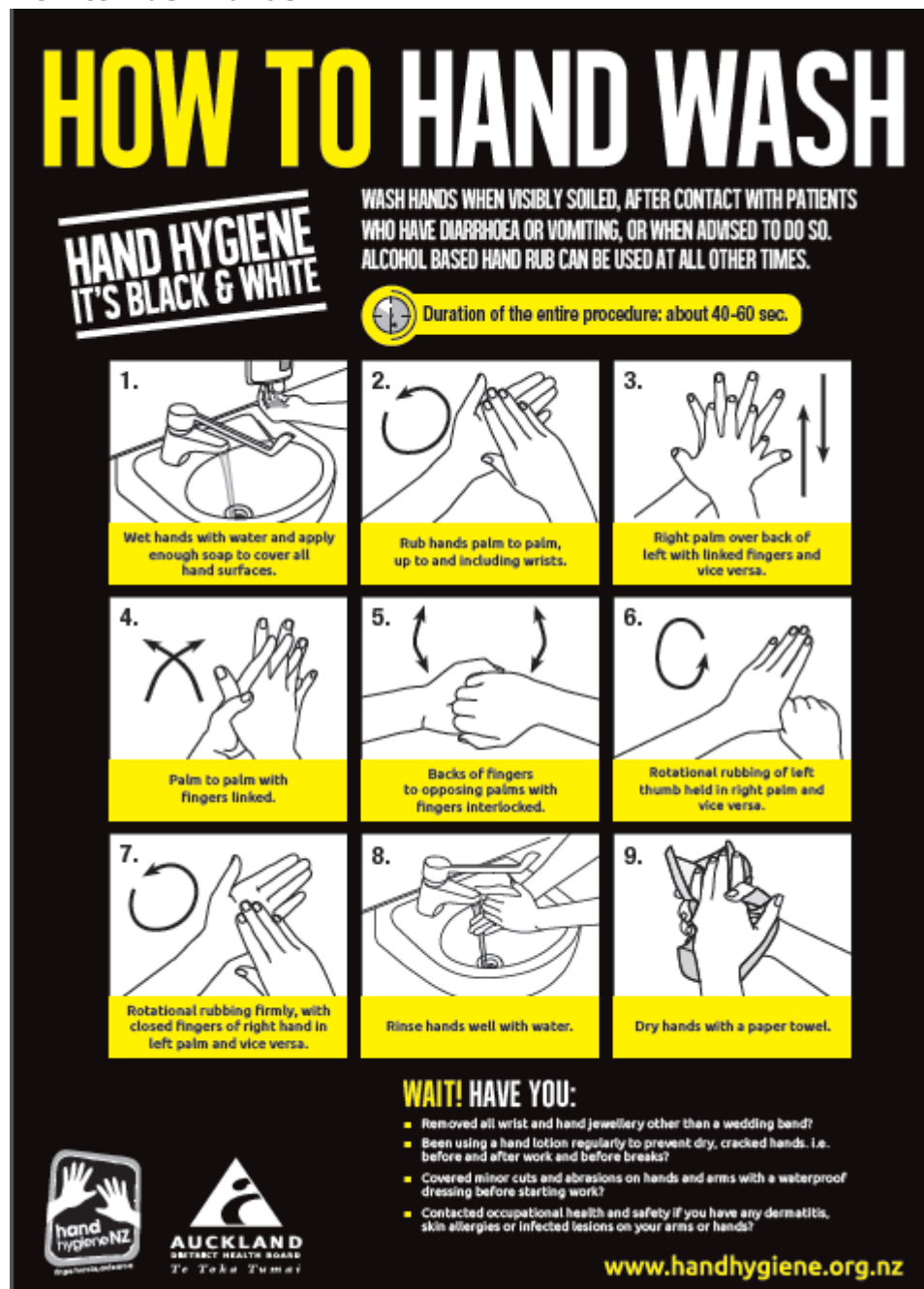
Figure 2 How to hand wash ( www.handhygiene.org.nz )

The World Health Organisation (2009) recommended this poster or a similar one, be posted above wash basins.